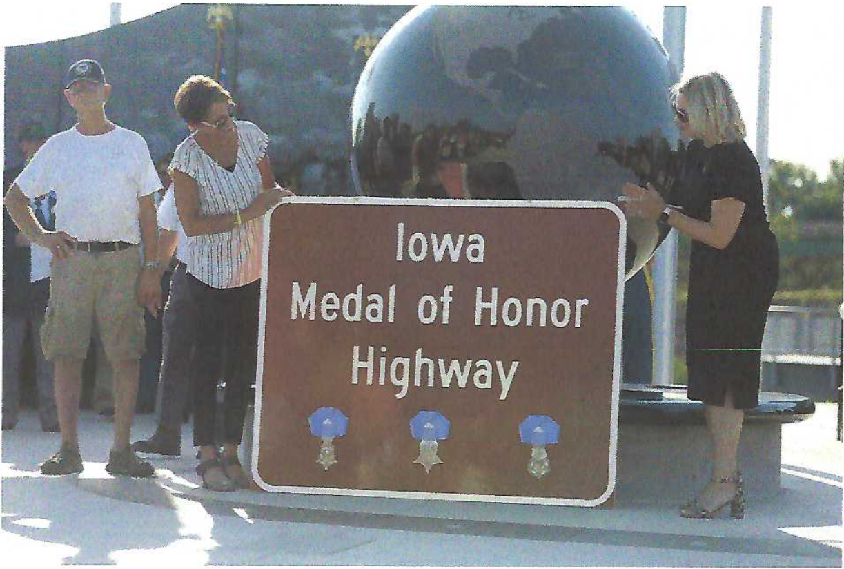
IOWA MEDAL OF HONOR HIGHWAY SIGN UNVEILED (1 of 12 signs on 302 miles of highway)