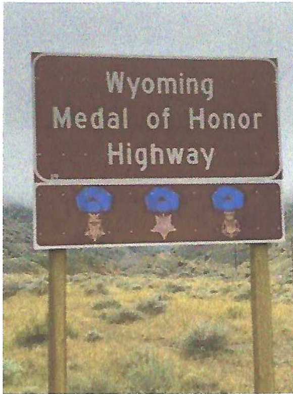
WYOMING MEDAL OF HONOR HIGHWAY SIGN (1 of 15 signs on 531 miles of highway)