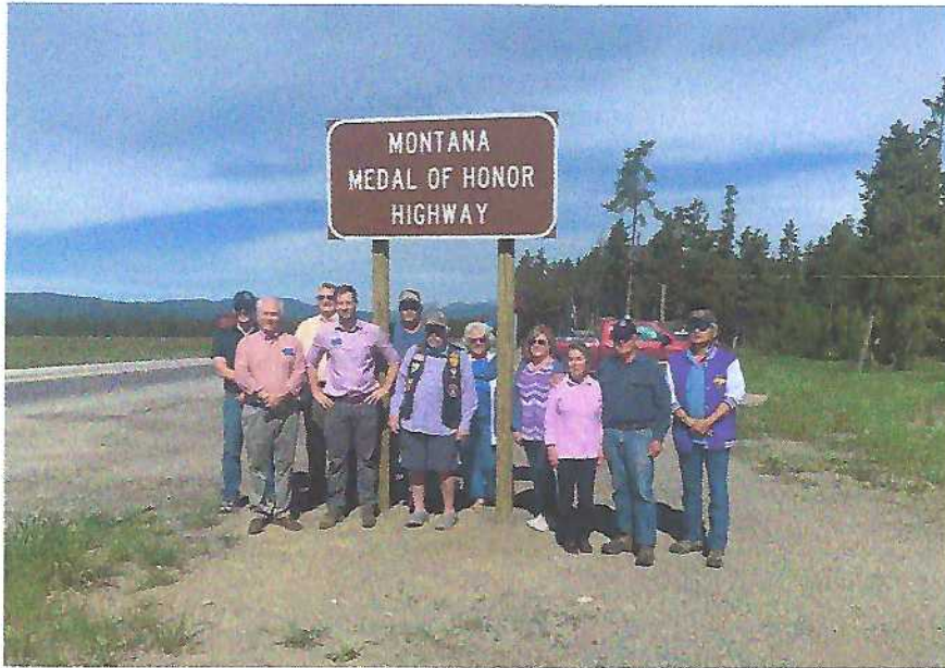
MONTANA MEDAL OF HONOR HIGHWAY SIGN (1 of 2 signs on 12 miles of highway)