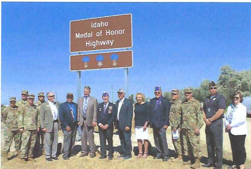
IDAHO MEDAL OF HONOR HIGHWAY SIGN (1 of 11 signs on 411 miles of highway)