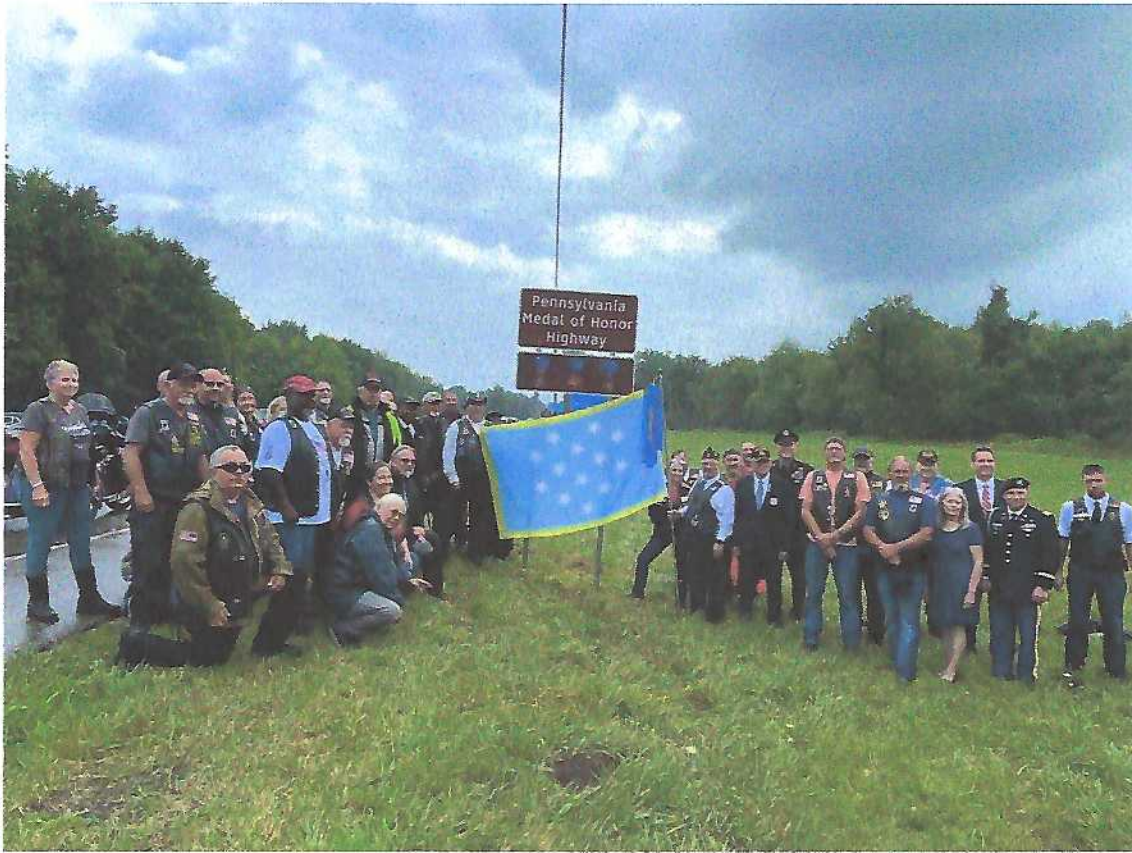
PENNSYLVANIA MEDAL OF HONOR HIGHWAY DEDICATION PARTICIPANTS