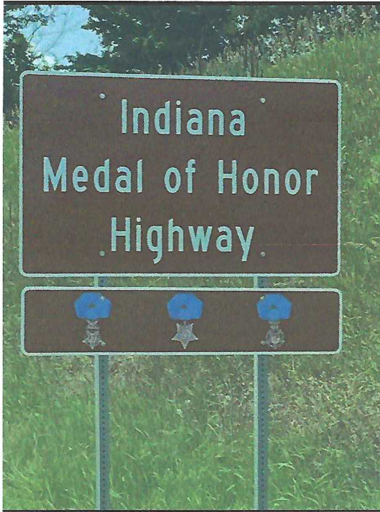
INDIANA MEDAL OF HONOR HIGHWAY SIGN NEAR OHIO BORDER (1 of 8 signs on 156 miles of highway).