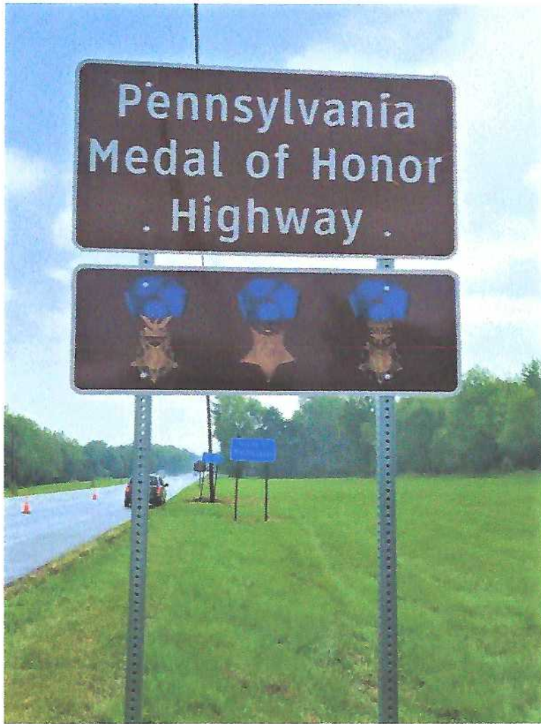
PENNSYLVANIA MEDAL OF HONOR HIGHWAY SIGN AT PA/OH BORDER (1 OF 2 signs on 45 mile highway). "WELCOME TO PENNSYLVANIA" SIGN IN BACKGROUND