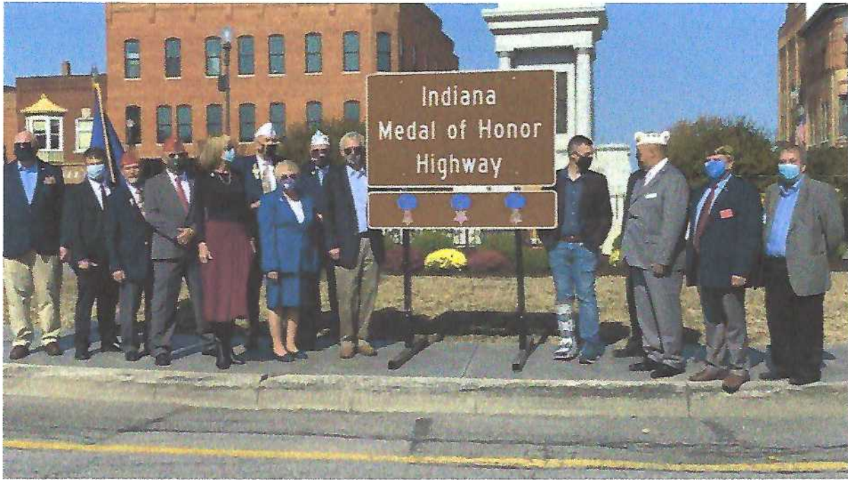
INDIANA MEDAL OF HONOR HIGHWAY DEDICATION, ANGOLA