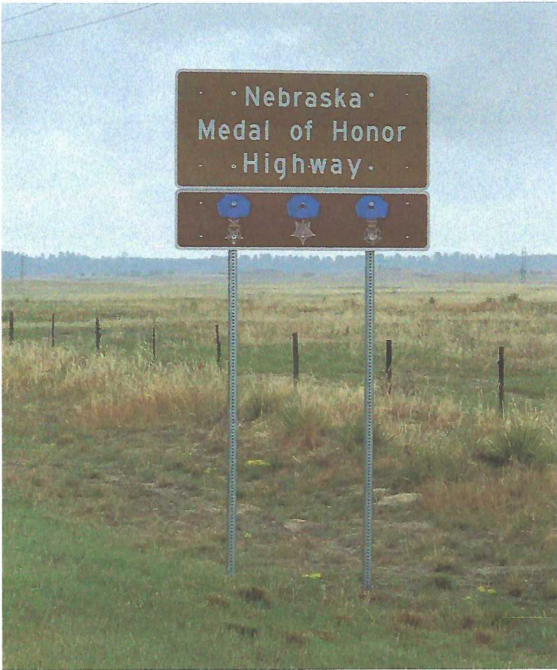
NEBRASKA MEDAL OF HONOR HIGHWAY SIGN (1 of 12 signs on 432 miles of highway)