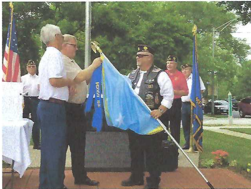
ILLINOIS MEDAL OF HONOR HIGHWAY DEDICATION, LA GRANGE AMERICAN LEGION POST 1941